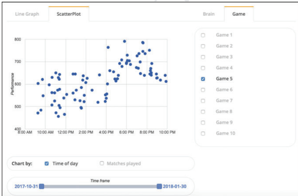
Fig. 5 A scatter plot depicting a player that performs better in the evening