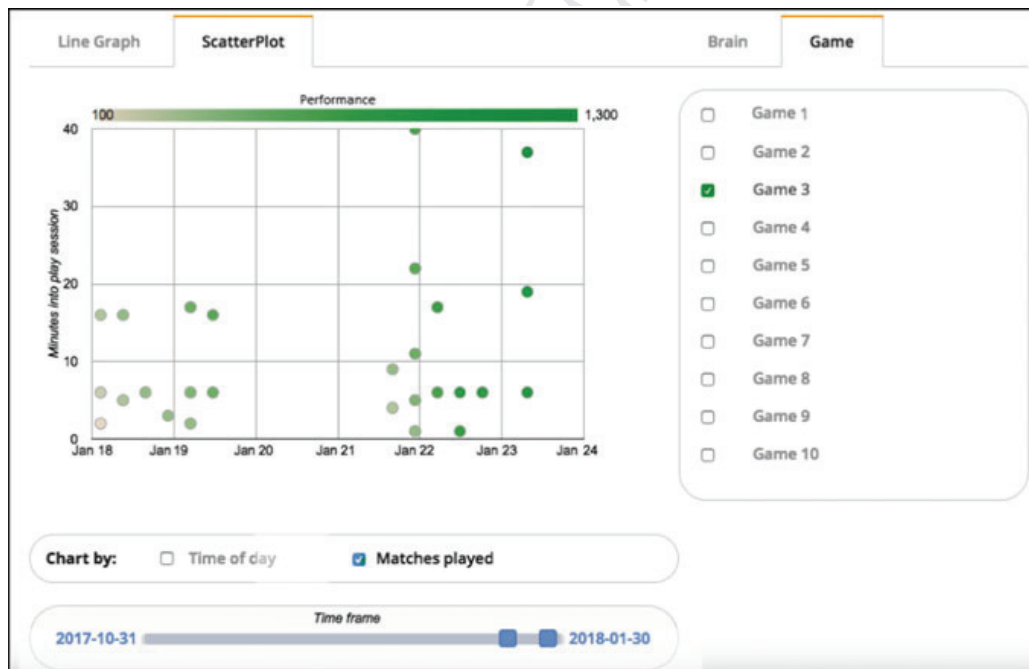
Fig. 3 Scatter plot of subgame performance by matches played in session

249 In Fig. 3, for example, we can see that in the first session on January 18th, three 250 subgames were played. The three points are light because the player had their lowest 251 performances in those games within the time frame that was selected on the bottom 252 of the screen with the time frame bar. Conversely, the last three subgames in the last 253 session on January 23rd have a dark green colored points indicating that the player 254 had their highest performance in those subgames within the selected time frame.