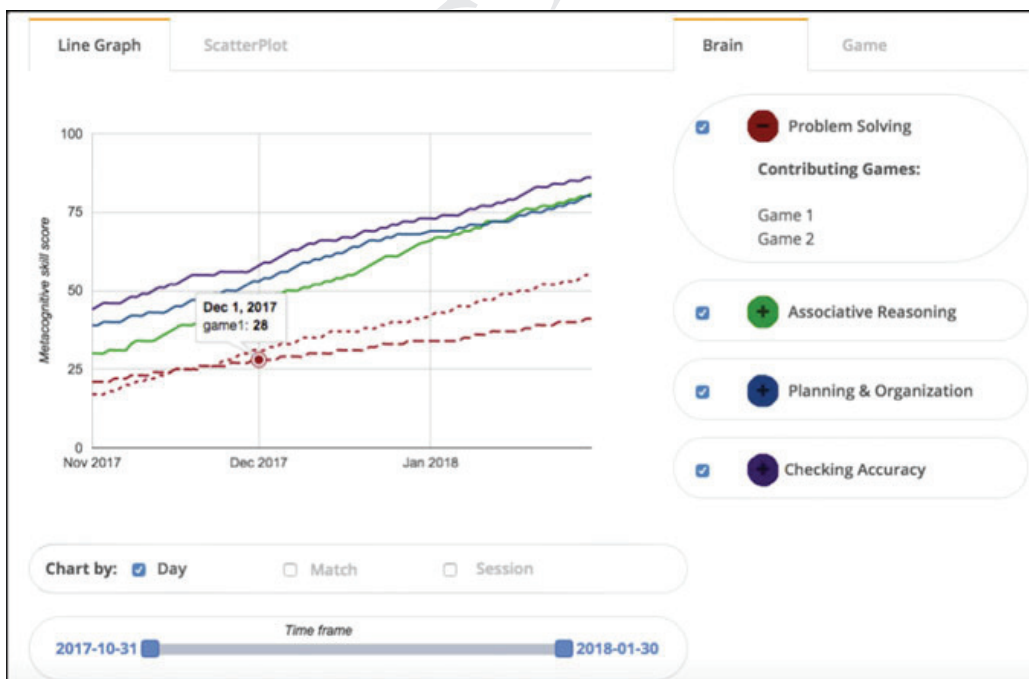
Fig. 1 Line graph of metacognitive skills improvement with problem-solving exploded

211 While the “Brain” tab allows players to see the improvement for each metacog- 212 nitive skill, at subgame level (i.e., either in the “Game” tab or when a metacognitive