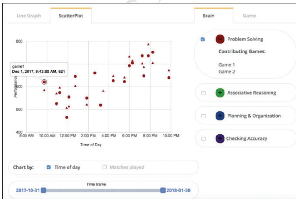
Fig. 2 A scatter plot depicting a player performing better in the evening

230 For example, Fig. 2 shows a visualization of a player that has played problem- 231 solving subgames between 8:00 am and 10:00 pm over three months. Points that 232 are close horizontally, represent subgames that were played around same time of 233 day. When grouping subgames by metacognitive skill in the scatter plot, points for 234 the same metacognitive skill are drawn in the same color, but different shapes are 235 used for different subgames. Because both subgames 1 and 2 are associated with